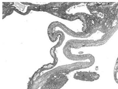
Figure 2 Case 2. Multicystic tumour with thickened septa.

rare, and is often misdiagnosed as renal carcinoma with a cystic component. 1-5 Here, we report two consecutive cases of multilocular cystic renal oncocytoma.