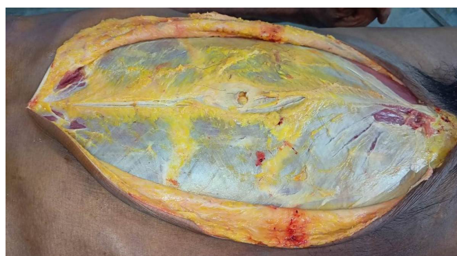
Figure 3 Skin incision deep through the subcutaneous tissue and fascial layers.

Once access was gained into the thoracic cavity, the heart and lungs were separated from the remaining parts of the mediastinum. The lung was pulled laterally from the mediastinum to