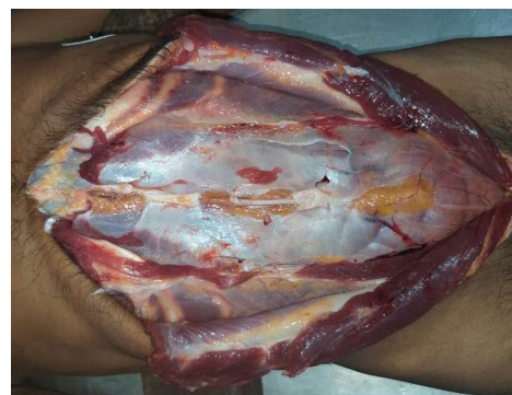
Figure 4 After removal of rectus abdominis, peritoneum intact.

expose and cut through the root and pulmonary ligament from above downwards close to the lung using a long blade knife. The lung was removed on each side and stored in a plastic bag to prevent it from drying. The heart was grossly examined for pathological changes, particularly for the pericardium and dilatation changes, and was finally removed.