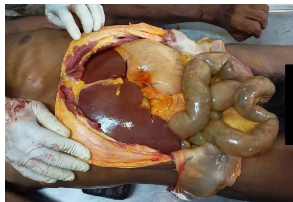
Figure 5 Abdominal organs after removal of peritoneum.

The PPE was discarded in the appropriate waste laundry. Reusable goggles and shields were cleaned and disinfected according to recommendations. Following that, hands were cleaned with soap and water before using alcohol-based hand sanitiser. Finally, the table, the instruments and the skin of the corpse were appropriately disinfected.