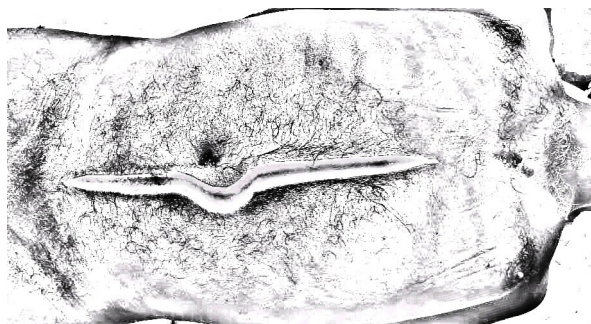
Figure 2 Skin incision from the xiphoid process to the symphysis pubis encircling the umbilicus.

omentum and trace the lesser curvature of the stomach downwards. Next, the stomach and the vascular attachments were cut and turned to the left to expose the lesser sac. Finally, the peritoneum was removed as far inferiorly as the attachment of the greater omentum. All other abdominal organs were dissected as per the conventional method. 16–20