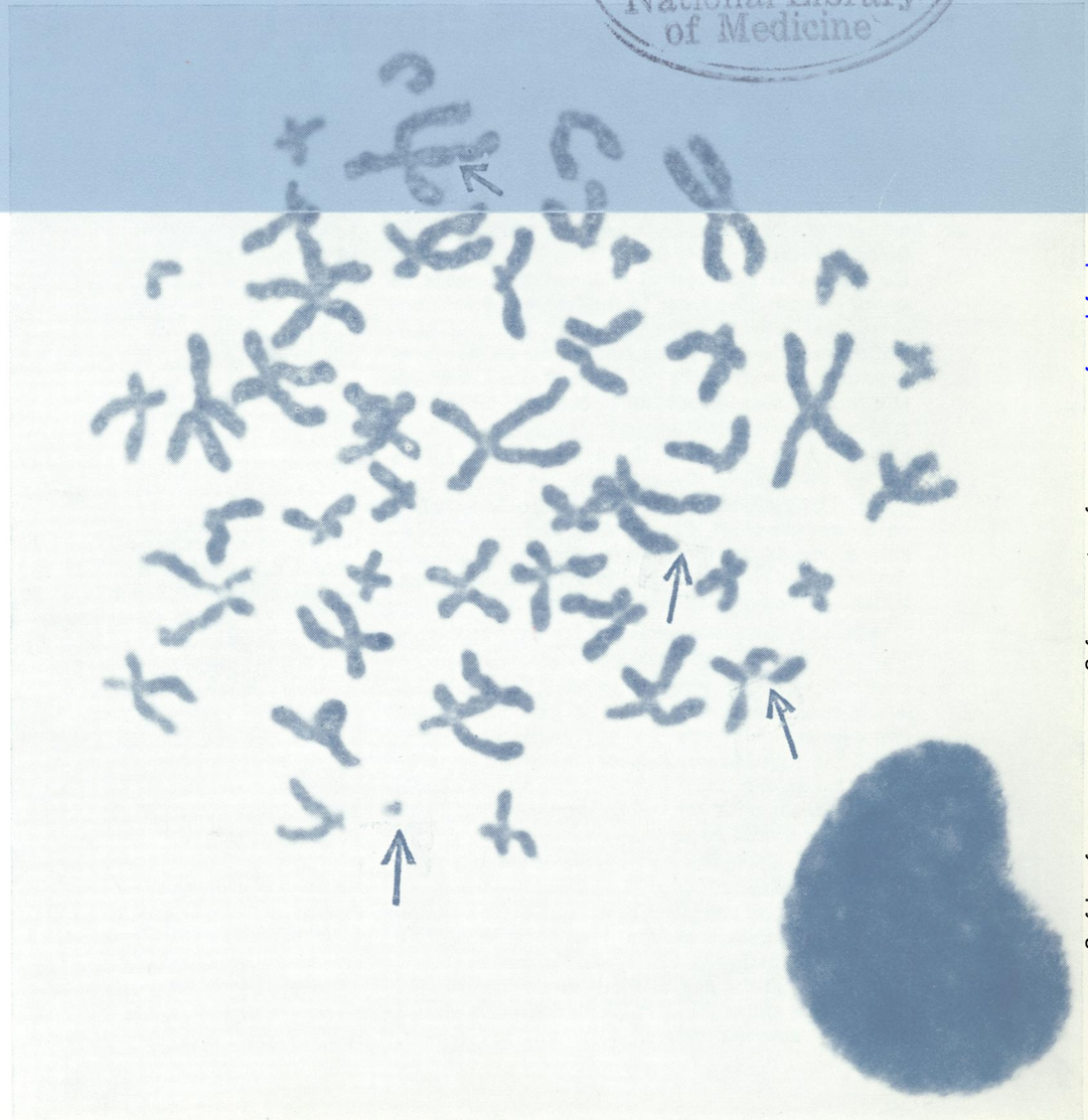
Bone-marrow metaphase plate containing 46 chromosomes plus one fragment. The arrows point to chromatid gaps, deletion, and fragment in A, B, and C-group chromosomes. See Fig. 3, page 555.