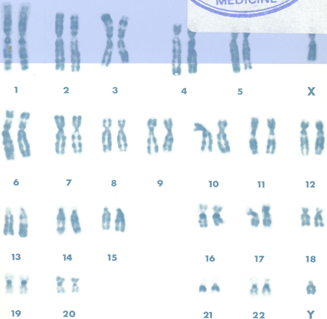
G-banded karyotype of a human male. See fig 1, page 573