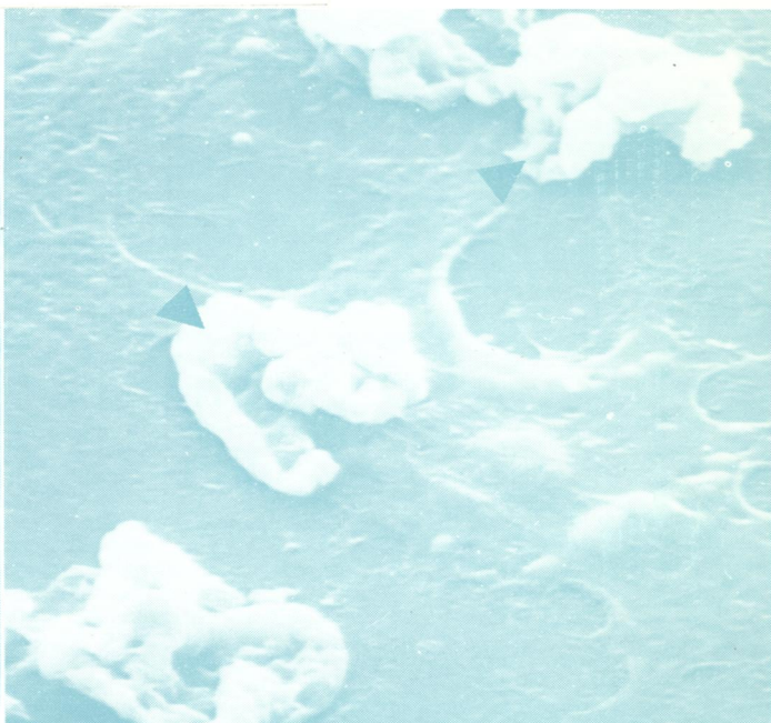
VERO cell culture showing pronounced cytopathic effects (stage II) with widespread areas of breakdown and numerous amoebae (N. fowleri strain MsT), some of which are indicated by arrows: (left) light micrograph; (right) scanning electron micrograph. See Fig. 3, page 5.