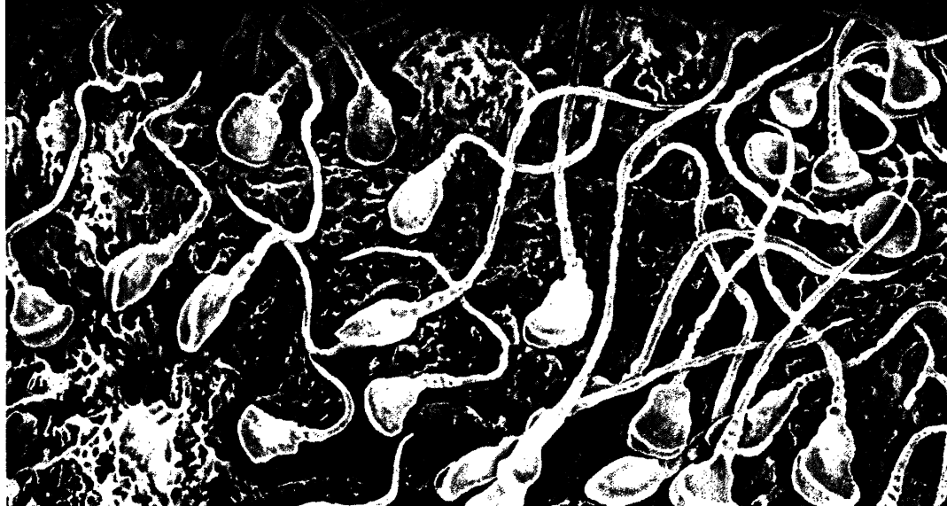
Representation of Spermatozoa at the surface of an ovum magnified approximately 2000 times.

Yes, if everything goes well. Even so, it needs all the skills of the gynaecologist and obstetrician to monitor progress and take action when complications arise. To support clinical judgement we offer four simple quantitative tests.