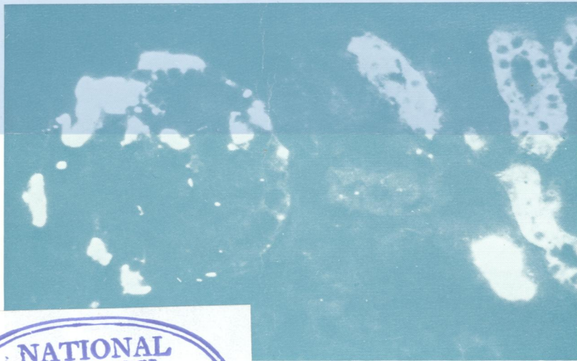
Tamm-Horsfall protein stains brightly in tubular casts as well as in distal convoluted tubules. Prominent aggregates in capsular space and between glomerular tufts (case 7). \times 150 . See Fig. 2, p. 621

NATIONAL LIBRARY AUG 25 1978 OF MEDICINE