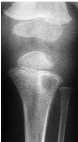
Figure 1 Follow up radiograph at 12 weeks. The lytic unilocular metaphyseal lesion is larger, better defined, and has developed a partly sclerotic margin. There is no definite cortical breach and no expansion.

onset of symptoms (aged 1 year and 7 months) and radiographs taken at that time had shown no significant abnormalities. Therefore, the lesion had progressed rapidly over three months (fig 1).