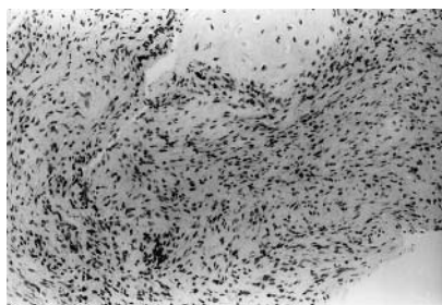
Figure 2 Photomicrograph showing the histological features of fibrocartilagenous mesenchymoma of bone.

The term fibrocartilagenous mesenchymoma with low grade malignancy was first described by Dahlin et al for a rare bone