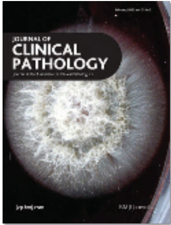
Cover image: Blastomyces colony