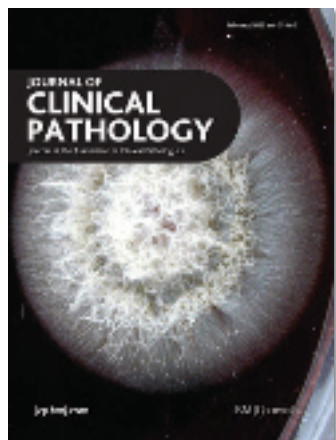
Cover image: Blastomyces colony