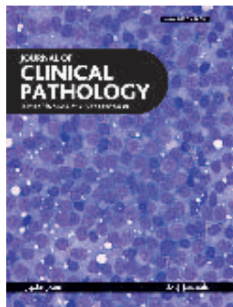
Cover image: B-CLL fine needle aspiration