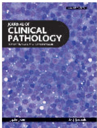
Cover image: B-CLL fine needle aspiration