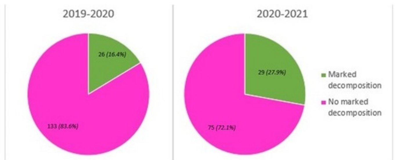
Figure 1 Frequency of marked decomposition change of studying cases.

The frequency of autopsy reports assigning cause of death as 'unascertained' demonstrated a 52.9% increase in 2020–2021; however, this change was not statistically significant ( p=0.331 ); this is most likely due to the sample size being too small, as the absolute number of 'unascertained' cases is generally very low (3.8% across both cohorts). Of the 10 'unascertained' deaths, 90% of them showed marked decomposition change.